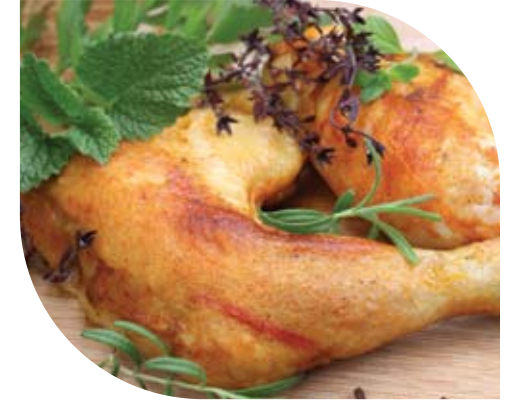
PLATE TO GATE